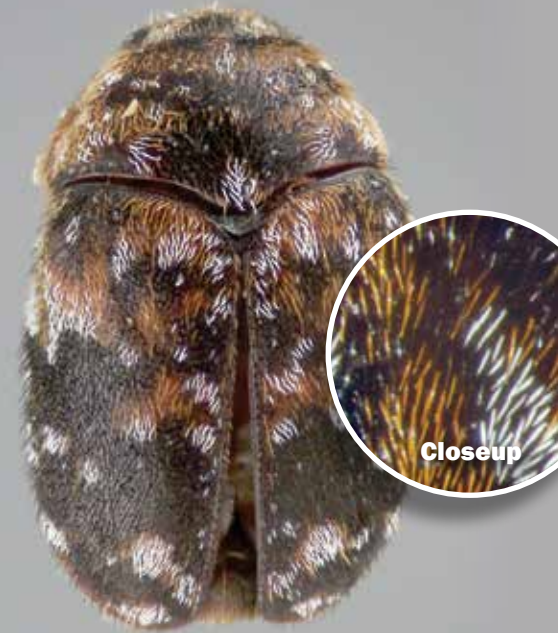
T. anthrenoides beetle is covered with hairs