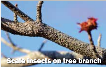
Scale insects on tree branch

2. Use detergent and water as a scouting tool for turfgrass insect pests. Some pests, such as mole crickets and caterpillars, hide deep in turf or soil and are difficult to detect. Drenching a small area of turf with 2 tablespoons of dish soap per gallon of water can cause these pests to come to the surface, where they can be identified and counted. Remember this is a monitoring tool used to determine pest presence, life stage, and abundance, not a pest control tool.