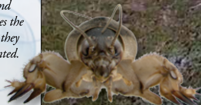
Southern mole cricket

Mole cricket soap flush is a monitoring tool. A mix of dish detergent and water flushes the pests out so they can be counted.