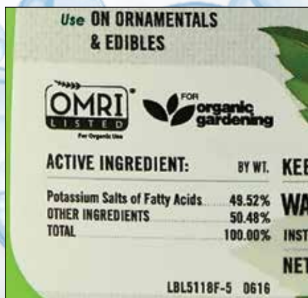
Insecticidal soap label